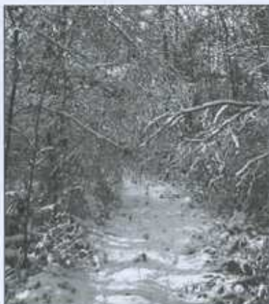
Chequamegon "before" photo.